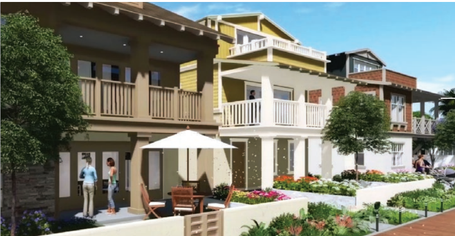
MISSION BEACH RESIDENCES Mission Beach, CA

59 Luxury Homes between the Pacific Ocean and Mission Bay