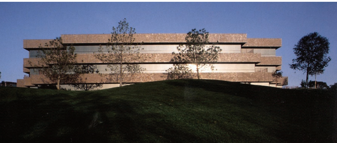
MCKELLAR RESEARCH CENTER La Jolla, CA

142,000 sf office/research complex, now part of UC San Diego